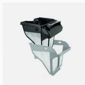
Filter canister Dual stage filter: 150/60 µ